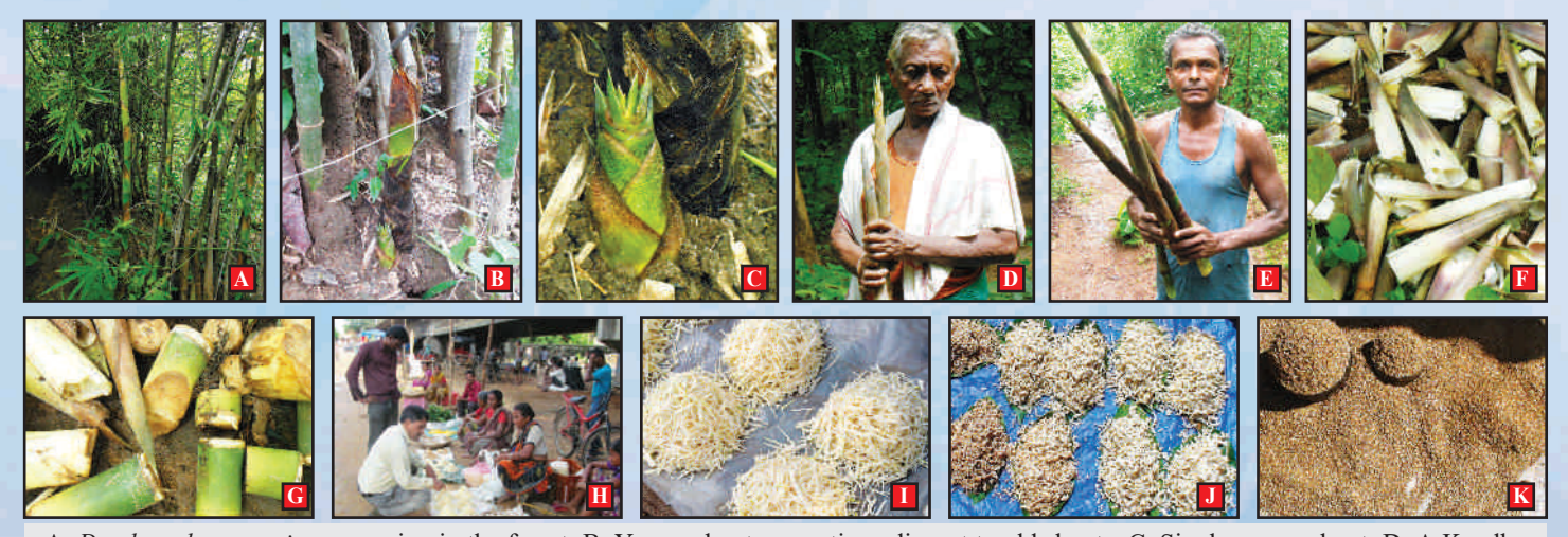
A. Dendrocalamus strictus growing in the forest; B. Young shoots sprouting adjacent to old shoots; C. Single young shoot; D. A Kandha tribal man with young shoots; E. A Gond tribal man with young shoots; F. Discarded culm sheaths of young bamboo; G. Removed green hard parts of shoots; H. 'Kardi', being sold in market; I. Juliennes; J. Juliennes of 2 – 3-day old; K. 'Handuwa', being sold in market