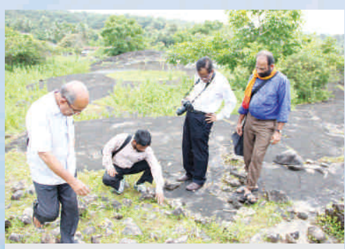
Habitat of Curcuma bhatii

upwards towards the Medical College and near it the species was found growing in the rocky crevices amidst grasses. This endemic species probably occurs only in the aforementioned spot. It is suggested that the State Forest Department personnel should monitor the area to take necessary measures to conserve this species from extinction.