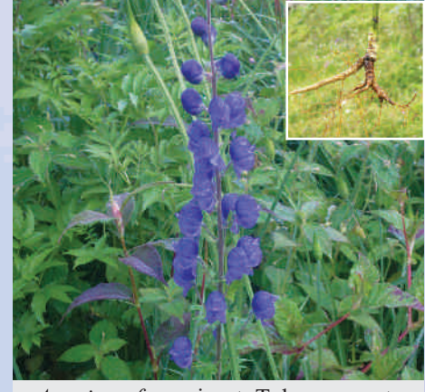
Aconitum ferox; inset: Tuberous roots